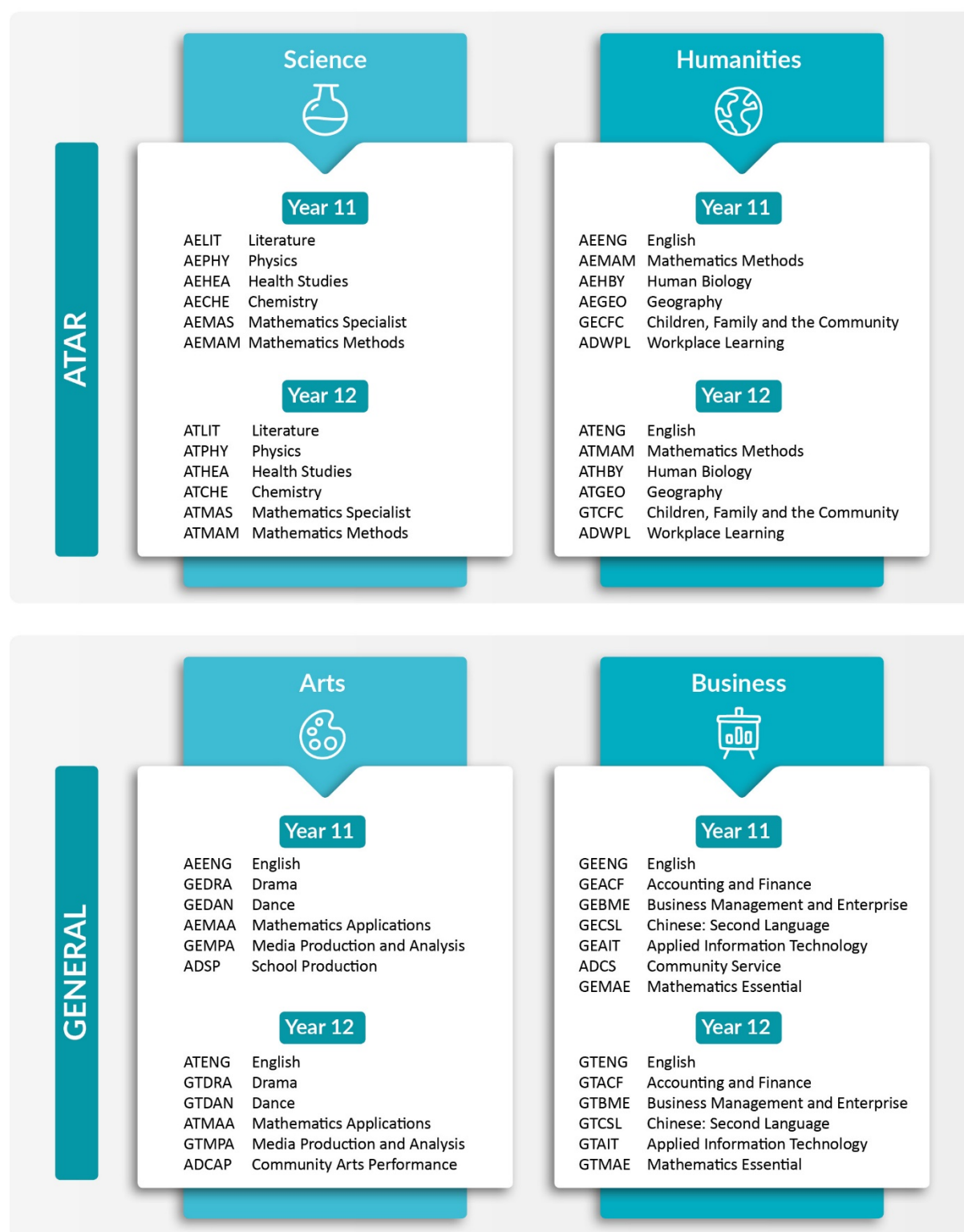
Figure 3. Sample programs – WACE 2021